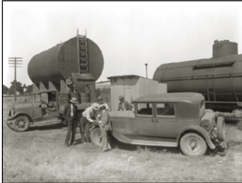
Cooperative oil association plant and delivery truck, Umatilla county, Oregon, 1934