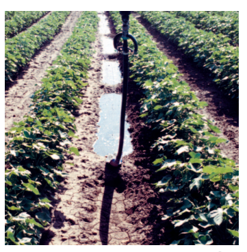
Figure 5. LEPA center pivot with a drag sock.

Another product, the LEPA "quad" applicator, delivers a bubble water pattern (Fig. 6) that can be reset to an optional spray pattern