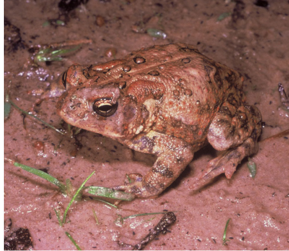
Figure 4. Houston toad.

Finally, if a species on a landowner's property is listed under ESA, the landowner should carefully review actions taken on the land to deter-