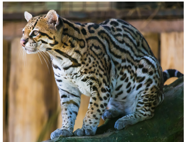
Figure 1. Ocelot.

The Endangered Species Act of 1973 is a federal law aimed at preserving sensitive ecosystems and human quality of life for future generations.