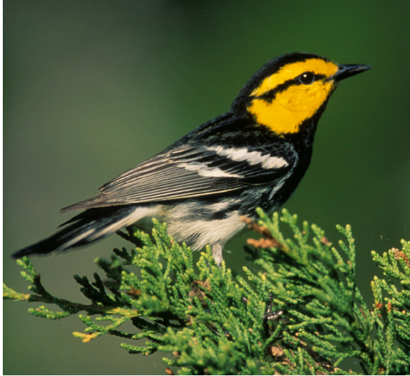
Figure 2. Golden-cheeked Warbler.

Since the beginning, the complex task of conserving imperiled species through the ESA has been a subject of conflict and controversy. This is likely because of the law's authority to protect the habitat of imperiled species, which is often on private lands. The ESA has undergone many changes and additions to address conflicts between landowner interests and species' habitat protections. The various provisions of the ESA explored below can help landowners understand their options and opportunities when dealing with a protected, or soon to be protected species on private land.